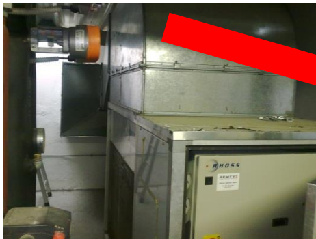
Figure below shows the malfunction of the cold generator which has influence on higher electricity energy use because of inadequate working space (closed or basement).